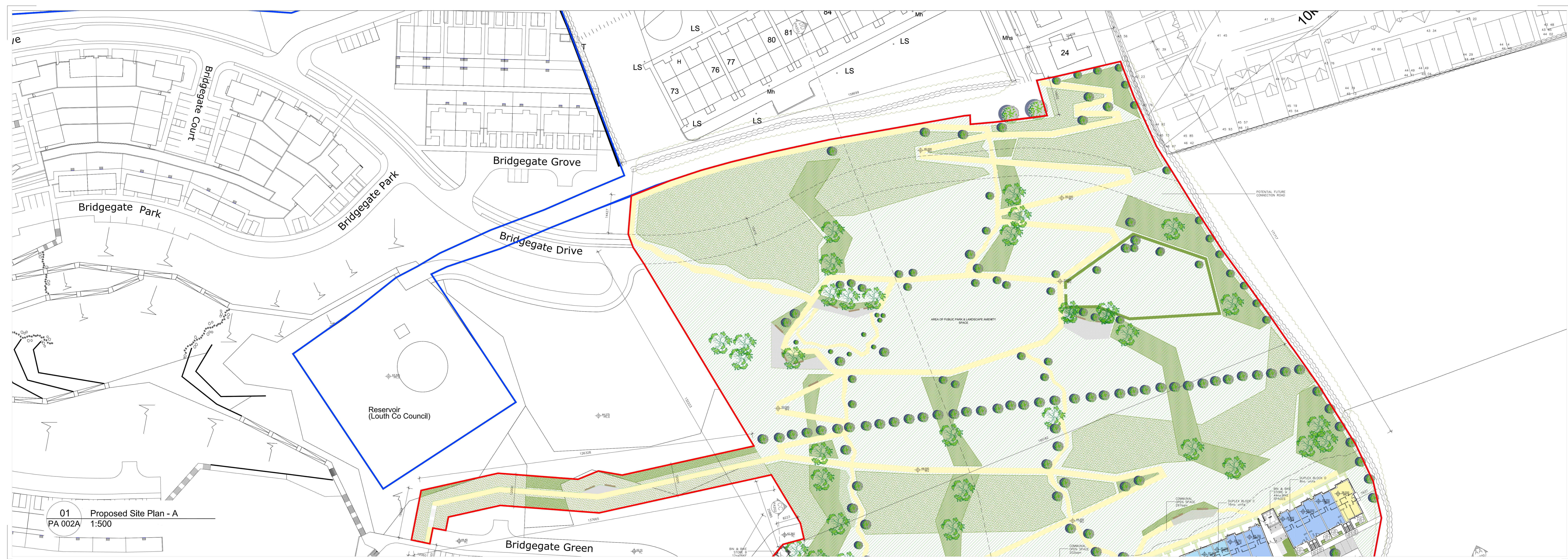
01 Proposed Site Plan - A PA 002A 1:500